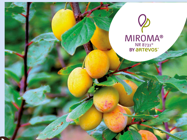
MIROMA® the attractive one

COMPREHENSIVE RANGE for the highest demands