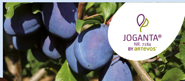
JOGANTA® NR. 7184 BY ARTEVOS®

INSTRUCTIONS: strong pruning and intensive thinning necessary to produce the aroma, plum pox tolerant