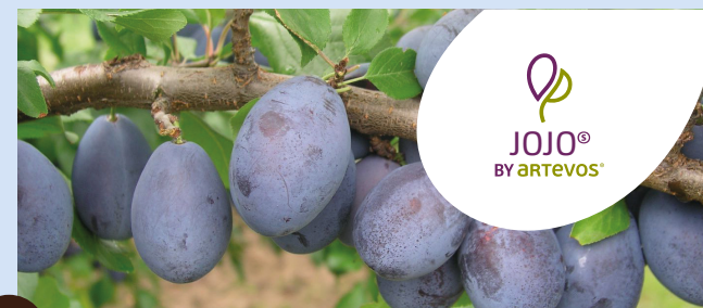
JOJO® BY ARTEVOS®

INSTRUCTIONS: plum pox tolerant, long harvest window, good taste, not suitable for cold locations