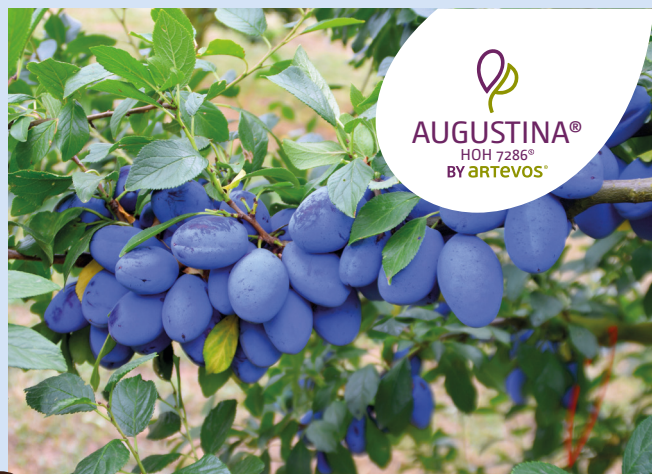
AUGUSTINA® HOH 7286® BY ARTEVOS®