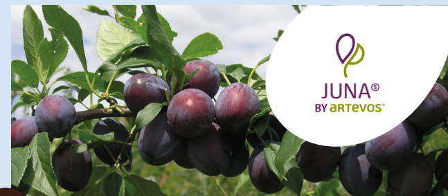
JUNA® BY ARTEVOS®

INSTRUCTIONS: remains stable on the tree, sensitive to frost