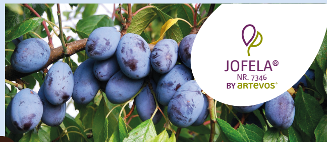
JOFELA® NR. 7346 BY ARTEVOS®

INSTRUCTIONS: suitable for fresh consumption