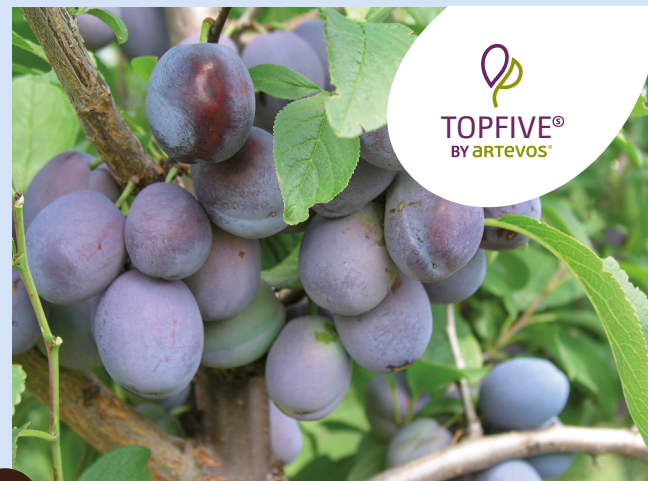
TOPFIVE® the juicy one