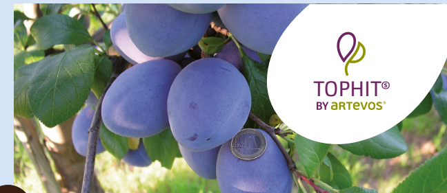
TOPHIT® the large one

plum pox tolerant – large-fruited – aromatic – productive