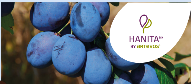
HANITA® BY ARTEVOS®

INSTRUCTIONS: low sensitivity to blossom frost, no pre-harvest fruit drop, uniform ripeness