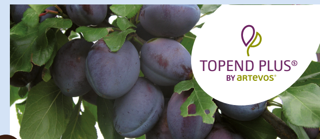
TOPEND PLUS® the late one