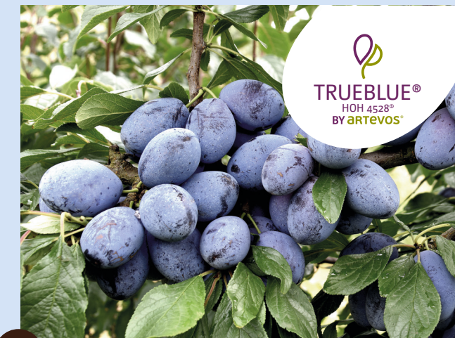
TRUEBLUE® HOH 4528® the loyal one