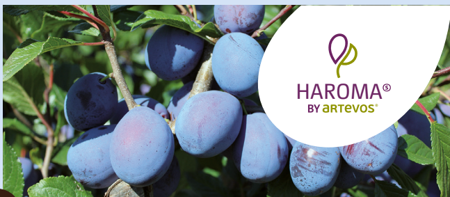
HAROMA® BY ARTEVOS®

INSTRUCTIONS: medium strong, steep growth, branches should be formed in the first few years