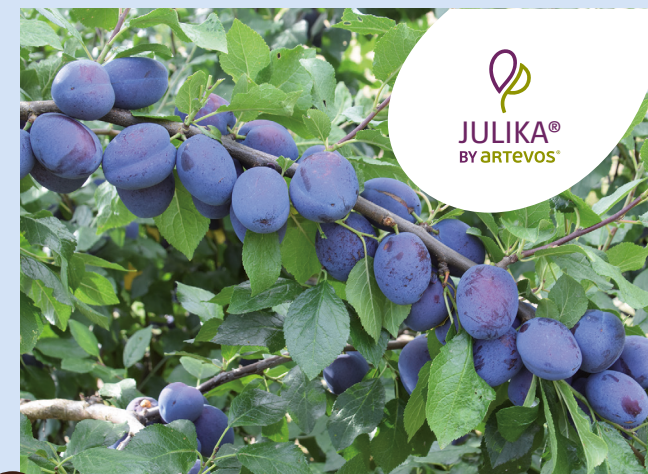
JULIKA® BY ARTEVOS®

INSTRUCTIONS: heat resistant, thinning recommended, otherwise the fruits remain smaller